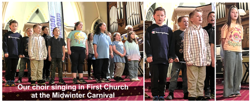
Our choir singing in First Church at the Midwinter Carnival

Community Oral Health Service | Health New Zealand Te Whatu Ora | Scan this code for more great tooth tips